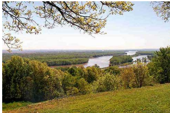
Mississippi River view from Little Dixie National Scenic Byway, Pike County

Through advocacy, education, and partnerships, we are reclaiming Missouri's endangered scenic heritage.