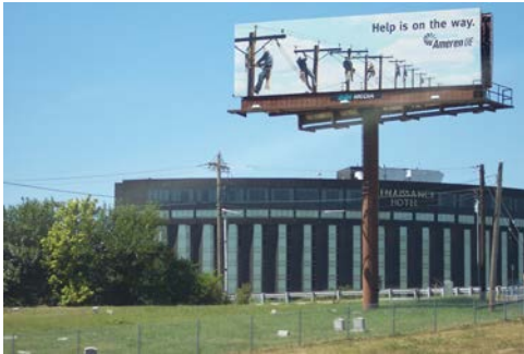
Billboard in Cemetery, St. Louis